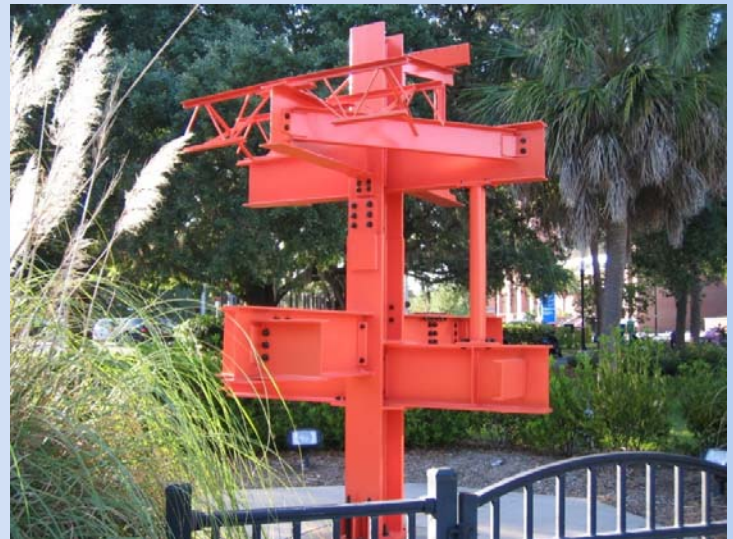
Fig 2. Meeting point