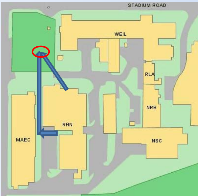
Fig 1. General Evacuation route towards meeting point.