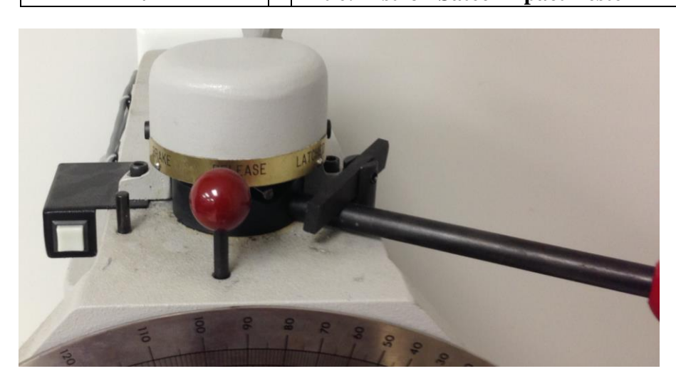
Figure 1: Lever positions (L to R: BRAKE, RELEASE, LATCHED) White button and red pin also shown