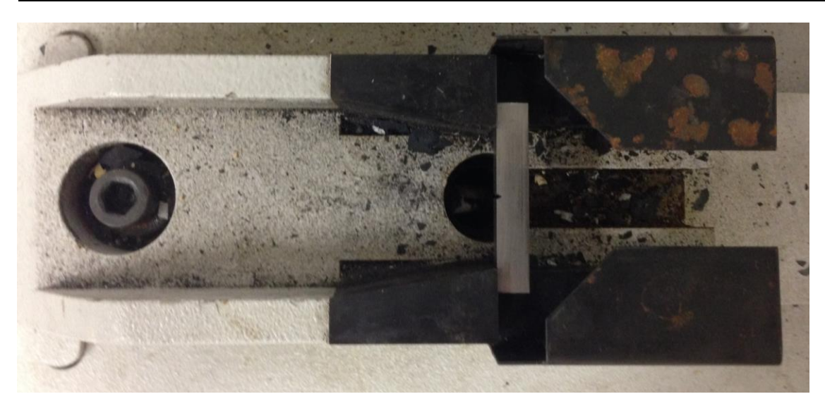
Figure 3: Sample loaded correctly (Hammer swings from right to left)